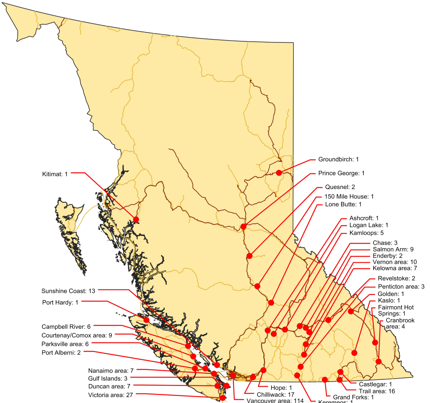
ABOVE: This map shows where all the 289 7th Division members live. The Yukon is part of the 7th Division, but is not shown here since we currently have no members there. To keep the map relatively simple some of the members living fairly close together have been grouped into area counts.

The membership roster has a field for date of birth, but the field is blank for about half the members, possibly due to changing membership information collection. It is possible to see that we have one member who is 99 years old, and one member who is 21, but there are likely younger members out there.